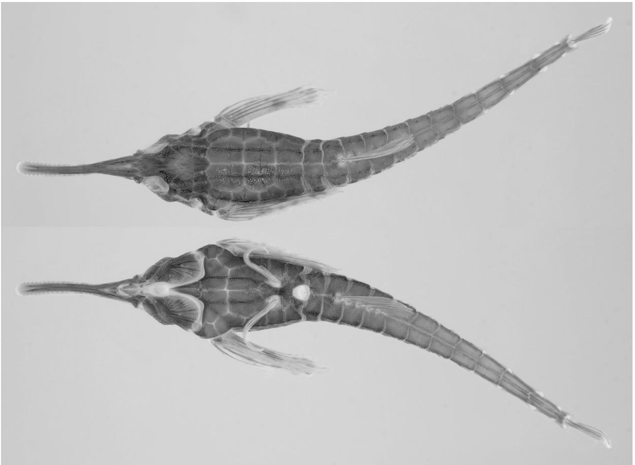
Figure 3. Dorsal (top) and ventral (bottom) views of preserved specimen of Pegasus volitans from Taiwan (ZUMT 19707, 59.5 mm SL).